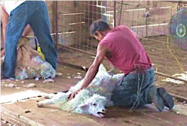
Shearing is a harrowing experience that leaves many goats bloodied and injured.

Goats face an extra abuse other farmed animals may not: some are kept alive for their fur, which is used to make mohair and cashmere. Long considered luxury fabrics, there is absolutely nothing glamorous about wearing hair that is forcefully removed from an animal. Shearers are generally paid by the volume of fur they produce, so work as fast as possible. Goats are prey animals—just being held down is terrifying. Witnesses have been filmed workers carelessly tossing the goats, tying their