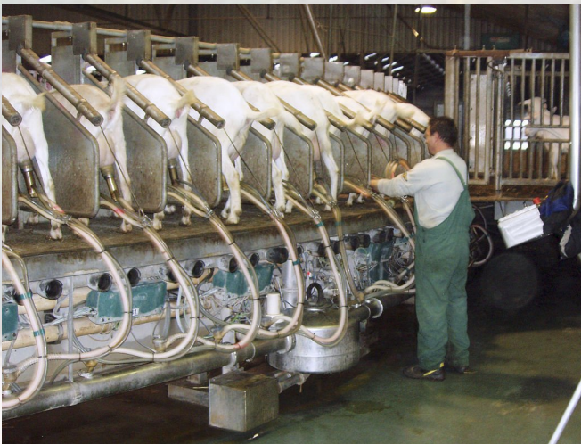
Dairy goats being milked by machines, rather than their own babies. These mamas, on average, will have 40 babies, stolen over 10 years.

Sheldon would have survived the trip to slaughter. He would have been forced into a line and shocked if his fear stopped him from moving forward. When his turn came, he would have been rendered unconscious with a bolt gun through his forehead before he was hung upside down and his throat was slit. Unless, as a prey animal, he was so terrified from the sights, smells, and sounds of other distressed goats, he may have wiggled and not been properly stunned—it happens. However, the slaughter line waits for no one. He would have been hung by an ankle and cut while fully conscious. As most goats are killed at less than a year of age, his skin would have been sold as “kid leather,” used for shoes, gloves, and purses. From the beginning of their lives until the end, all goats raised for food live a life of fear and pain until the moment of their death. And even after, they are denied dignity.