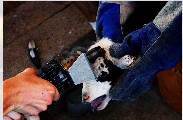
The UK requires pain relief and local anesthetic for disbudding. The USA does not.

If Pinky had been born into this environment, he would have been “disbudded” at just a few days old. His horns, which contain nerves and vessels, would have been burned off without pain relief. The burning process is as painful as you would imagine, and it is not fast.