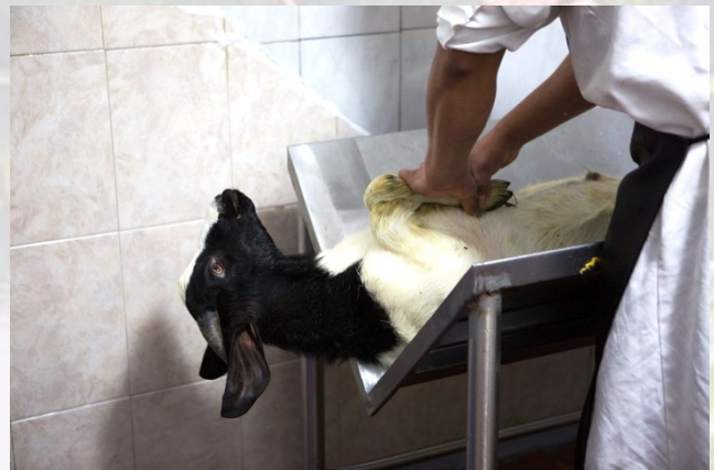
A goat is prepared to be slaughtered in the halal fashion at a live market in Brooklyn.

The best friends were rescued from a live market in NYC—where there are more than 80 such markets. Here, consumers can buy their animals live and kill them at home or have them slaughtered onsite. The demand for goat meat in the United States is on the rise, due in part to the growth of an increasingly multi-cultural population. Currently, the largest number of goats are slaughtered in Asia and Africa. Goat is a popular Muslim dish and is also a tradition at many holiday feasts—as turkeys are in the United States at Thanksgiving, or pigs at Christmas. Religious beliefs require meat be slaughtered in accordance with halal laws. As such, they are not stunned before their throats are slit.