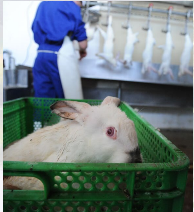
Food and fur rabbits endure a life and death of pain and terror.

blinked out, the eyes are held open—often for days at a time. And remember: rabbits eyes will not water or tear. Many of these chemicals are in fact irritating, and cause pain, swelling, and even blindness. All the while, experimenters take notes, and rabbits struggle helplessly to relief the pain. Draize tests are also used on skin. Layers of skin are pulled off with tape, and the substance is placed on the skin and covered in plastic. The substance might burn, itch, and bleed. These tests are always performed without pain relief.