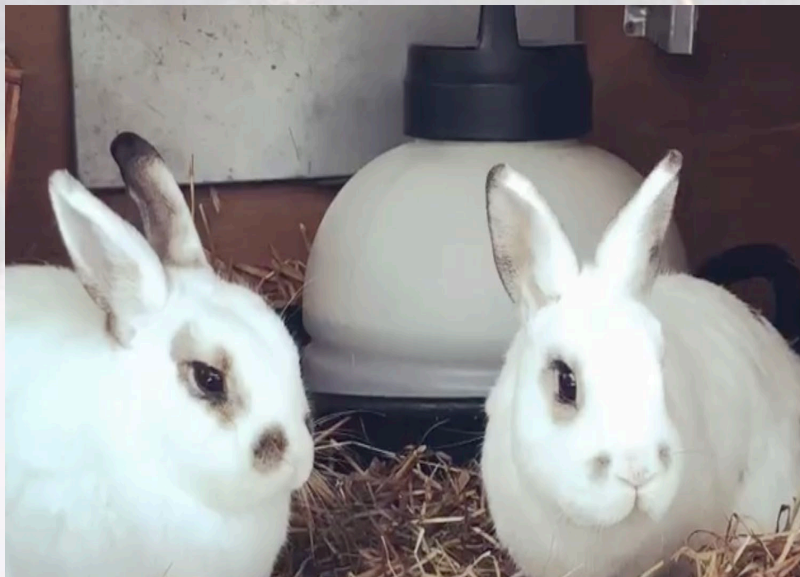
Mama Vintage and her boy 'Tique, were always close to one another. Their loving bond was obvious—and not just because they look so much alike!

Mama Vintage was abandoned by an uneducated or uncaring former "owner." However, she was able to live out her last days in a warm, safe home, loved by everyone who met her. Her kits will only know love, sunshine, and fresh air. The cab driver that picked them up had his heart in the right place—and likely saved their lives. You, too, can save lives. Choose cosmetics and cleaning supplies that are not tested on animals. Don't wear clothing made from rabbits. Share posts and tag brands so they know you aren't using their products. Working together, we can ensure all rabbits have an opportunity to experience a natural life...and joy.