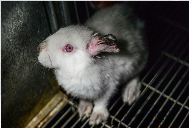
A rabbit suffering from a painful necrotic ear, living in filthy factory farm conditions.

Sadly, poor ownership is not the worst fate rabbits face. Rabbits are raised for food in factory farms, just like every other animal humans eat now. In fact, the times in which we live are being referred to as “the cage age”, because of the vast numbers of animals held worldwide in extreme confinement. Rabbits are one of them. In the United States alone, about 2 million-8 million rabbits are raised for meat a year, not accounting for the approximately 75,000 breeding rabbits that are used as production machines until they are spent. The huge estimate range speaks to the fact that the USA government does not require inspection of rabbit “meat” raised here . The FDA only requires that imported rabbits be inspected. As a result, it’s estimated that 75% of rabbit meat sold has not been inspected—for decomposition or “contamination by filth.”