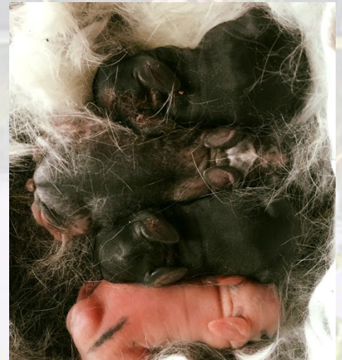
Aww! Adorable little newborns keeping warm in the nest their mama made.

Mama took excellent care of her babies, even using her own fur to make a nest for her babies to snuggle in and burrow under. To the non-rabbit person, Mama may have seemed